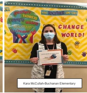
Kara McCullah-Buchanan Elementary