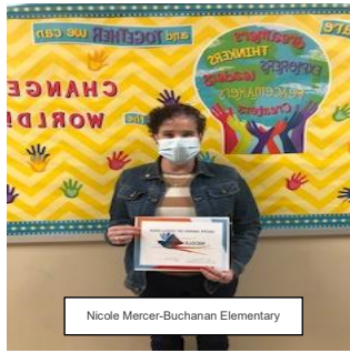
Nicole Mercer-Buchanan Elementary