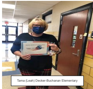
Tama (Leah) Decker-Buchanan Elementary